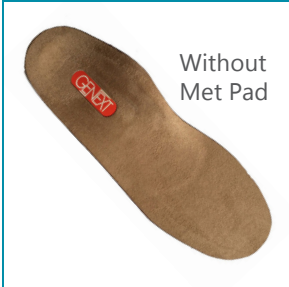
Without Met Pad