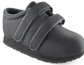
Item MX600 - The Classic MAX

Sizes: Women's 3 - Men's 15 Widths: 2E, 4E, 6E