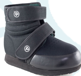
Item #600-H - The High Top

Sizes: Full sizes Pediatric/Women's size 1 thru Men's 17