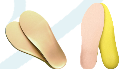
Item 3Pins Tri-Lam Heat Moldable