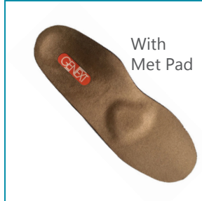
With Met Pad