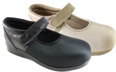
Item #500 - Mary Jane in Black Item #501 - Mary Jane in Beige

Sizes: Women's 5 - 12 Widths: Medium, Wide, X-Wide