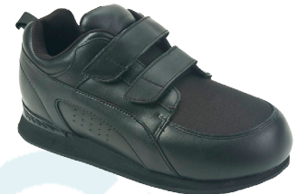
Item #800 - Stretch Walker Black

Sizes: Women's 5 - Men's 15 Widths: Wide, X-Wide, XX-Wide