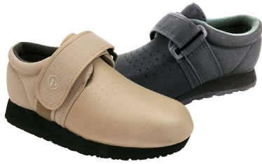
Item #600 - The Classic in Black Item #601 - The Classic in Beige

1-800-750-6729 www.pedors247.com fax 800-446-3101