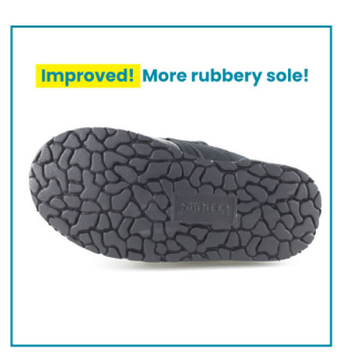
Colors Black (#600) Beige (#601)