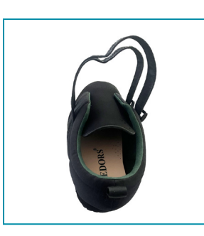
Widths 5X-W (10E)