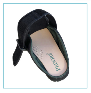
Colors Black (#SL600)