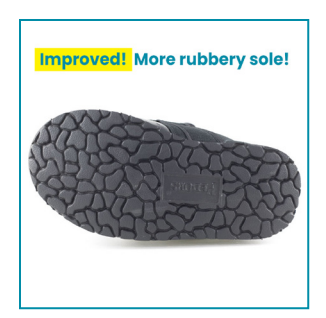
Color Black Only