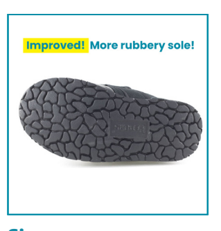
Colors Black (#MX600)