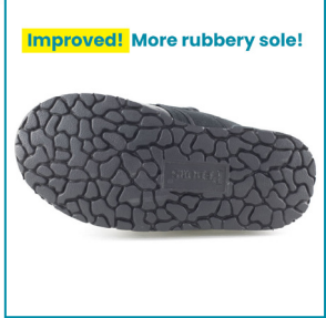
Sizes Women's 7 - 17 Men's 7 - 15