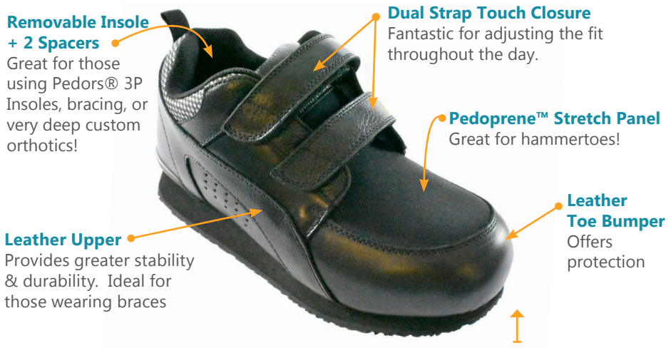
Toe Spring Reduces risk of trips and falls

Designed For: Accommodating AFO's, hammertoes, bracing, custom orthotics, edema. Removable spacers for additional depth