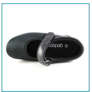
Widths Medium (B/C) Wide (D/E) X-Wide (2E)