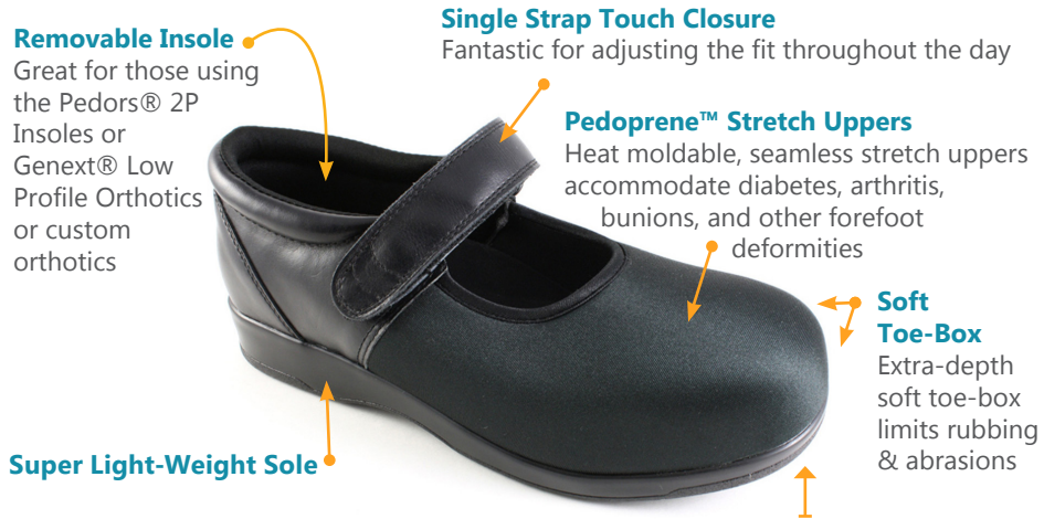
Toe Spring Reduces risk of trips and falls

Designed For: Designed as a dress shoe for forefoot deformities and edema. Open face can accommodate severe edema.