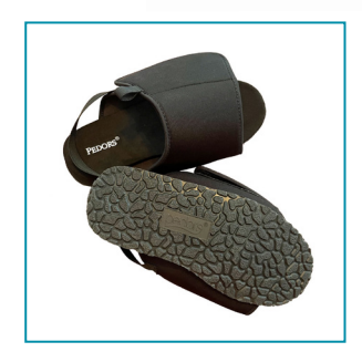
Colors Black (#WRX600)