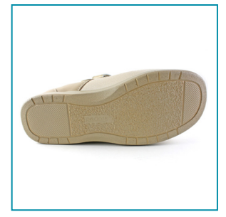
Sizes Women's 5 - 12