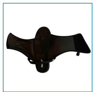
Widths XXX-Wide (6E)