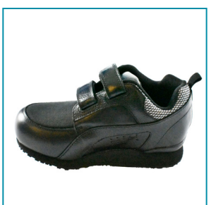
Widths Wide (D/E) X-Wide (2E) XX-Wide (4E)