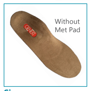
Sizes Women's 5 - 12 Men's 7 - 15