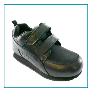
Closures Touch Closure (#800)