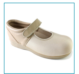
Colors Black (#500) Beige (#501)