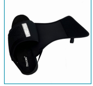
Sizes Women's 5 - 17 Men's 7 - 15