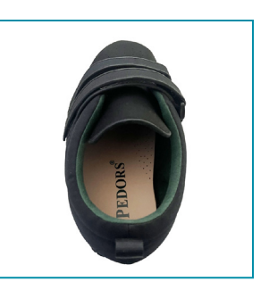
Sizes Women's 9 - 19 Men's 7 - 17