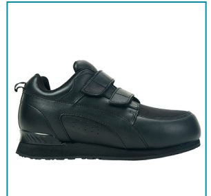
Sizes Women's 5 - 17 Men's 7 - 15