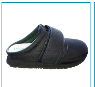
Widths XXX-Wide (6E)