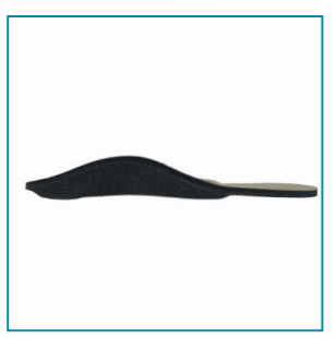
Forefoot Options Neutral - normal Met Pad - for ball of foot pain