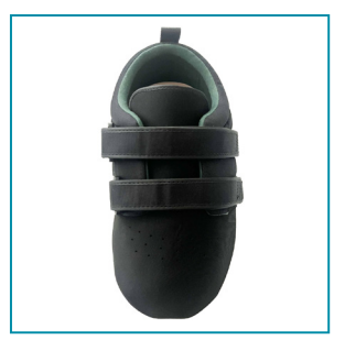
Colors Black (#SMX600)